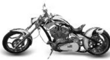
Viega's Custom Designed Chopper

On an interesting note, earlier this year, the stars of the hit television show, "American Chopper" built a unique motorcycle incorporating Viega's copper and stainless steel Viega ProPress® fittings. The Teutul family trio - Paul Sr., Paulie and Mikey ,