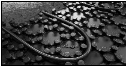
Viega Snap Panel

It all started with the pour of a nice brew. Founded by Franz Viegner in the small town of Attendorn, Germany in 1899, Viega's first product offering was a brass beer tap. By 1901, the