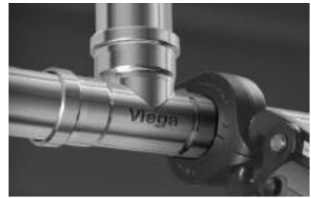
ProPress® Stainless Pipe Fittings

New for 2008, Viega is introducing a ProPress® Stainless line complete with fittings, valves and pipes, in 304 and 316 stainless steel. This product is for industrial applications where