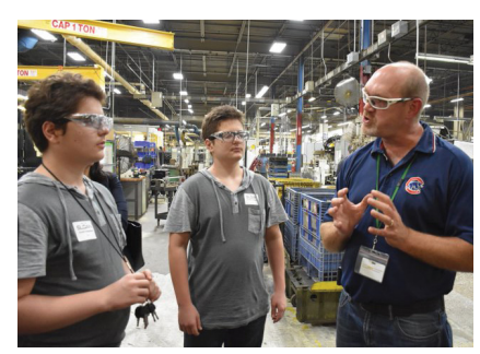
Students tour a Sloan Valve Co. manufacturing facility

The article emphasized how public misperceptions about manufacturing careers continue to persist, and recent research supports that point. While eight out of 10 Americans believe