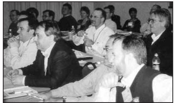
Demand Forecasting Seminar participants engage themselves with the content presented.

High inventory, poor customer service and reactionary expediting costs are often blamed on poor forecasts. Blame is misplaced when these results are caused by processes that require predictive accuracy beyond the capability of any forecast. Forecasting is a cross functional process that must balance a variety of factors.