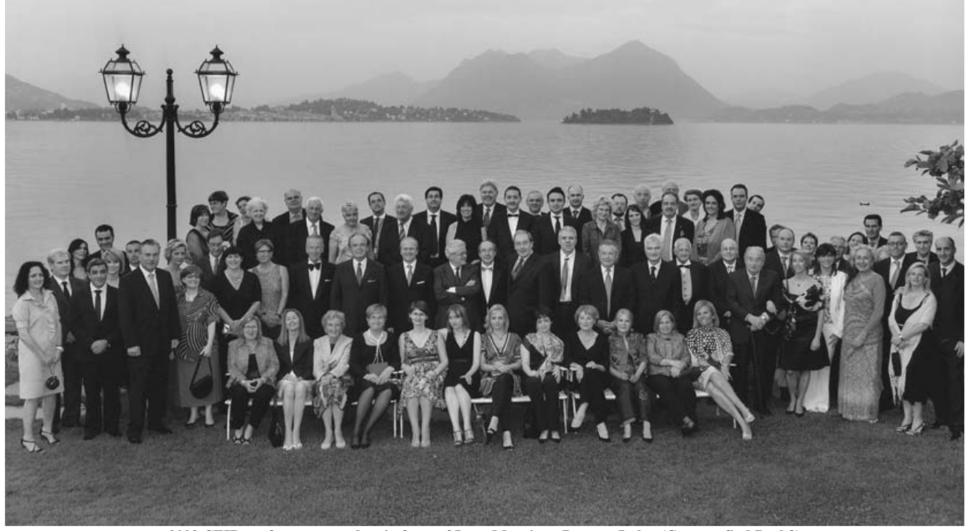
2009 CEIR conference attendees in front of Lago Maggiore, Baveno, Italy. (Can you find Barb?)