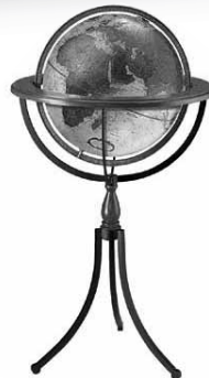
Replogle Santa Fe Globe