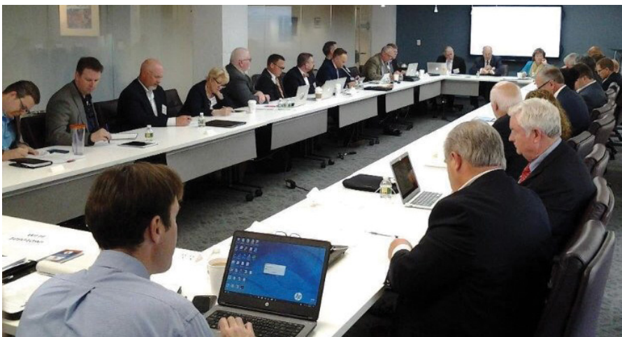
PILC members work collaboratively on high-level strategic issues that impact the plumbing industry.

A preconference survey was sent to attendees to prioritize issues for discussion. The lengthy list provided rich content for future meetings in the years to come.