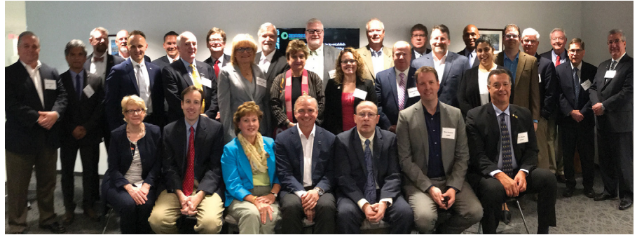
PILC members were well represented at the organization's 6th annual meeting, held on May 24 in Washington, D.C.

A record 20 associations represented by the chief executives and their volunteer leadership attended the 6th annual meeting of the Plumbing Industry Leadership Coalition (PILC), on May 24, 2017 at the headquarters of the National Institute of Building Sciences (NIBS) in Washington, D.C. The next meeting will be held in conjunction with the 2018 Emerging Water Technology Symposium, May 17, in Ontario, Calif.