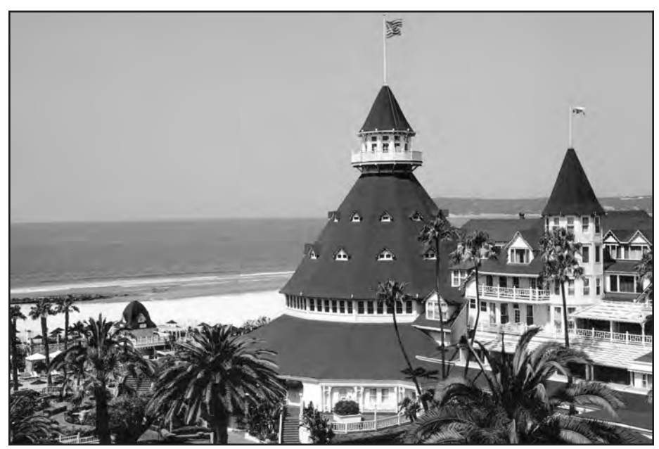
The Hotel Del Coronado, located in San Diego, CA. The site for the PMI Spring Meeting.

Registration and hotel information are available at <a href="https://www.pmihome.org">www.pmihome.org</a>. Please note, the registration deadline is February 12. Don't delay, secure your spot for what could be one of our hottest meetings yet! And we don't mean the warm California weather!