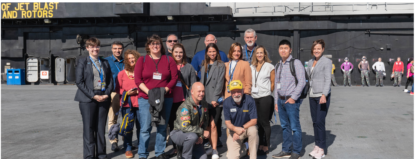
Participants were given a tour of the ship's deck and hangar, where various aircraft were on display for the museum's visitors.